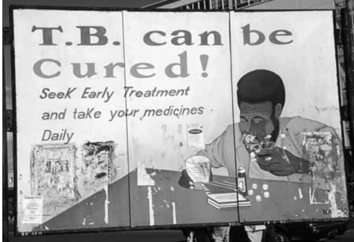
A TB campaign billboard in Lusaka, Zambia.