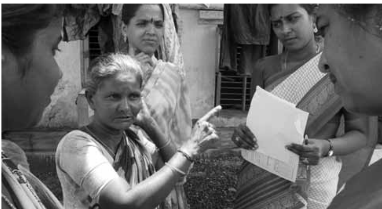
This woman in Chennai, India, talks to TB awareness campaigners.

Nearly 10 years after the launch of an international effort to tackle the global health emergency of tuberculosis, TB remains one of the world's major causes of death. Millions of people are undiagnosed because of fear, stigma, poverty and ailing health systems. The media's role in dispelling fear and providing clear, factual information is vital.